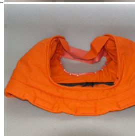
500010 Cape top (premium)

Fits on helmets - Blastsafe ORIGIN - Silencer Blasthelmet (older versions)