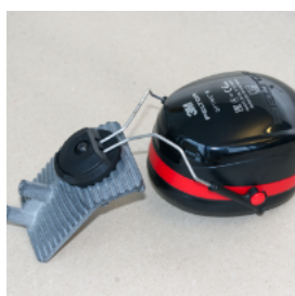
401001 Bracket and ear muff - single (OPTIME3) - Complete

- Complete Fits on helmets - Blastsafe ORIGIN