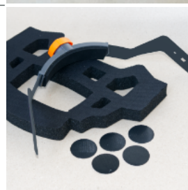
401005 Headband and detachable softpad - Complete

Fits both sides on helmet - Blastsafe ORIGIN