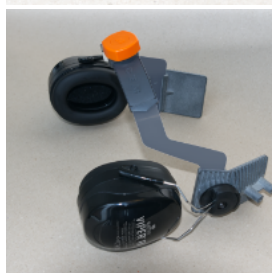
401008 Headband (VIPER2) - Complete

Fits on helmets - Blastsafe ORIGIN - Silencer Blasthelmet (older versions)