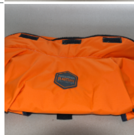
500020 Cape bottom (premium) - Complete

Fits both sides on helmet - Blastsafe ORIGIN