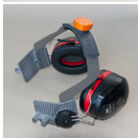
401003 Headband (OPTIME3) - Complete

Fits on helmets - Blastsafe ORIGIN - Silencer Blasthelmet (older versions)