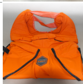
500000 Cape - top and bottom (premium) - Complete

Fits both sides on helmet - Blastsafe ORIGIN