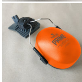
401012 Bracket and ear muff - single (PRIME) - Complete

Fits both sides on helmet - Blastsafe ORIGIN