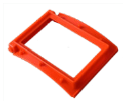
104500 Inner visor frame

Fits on helmets - Blastsafe ORIGIN - Silencer Blasthelmet (older versions)