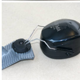
401009 Bracket and ear muff - single (VIPER2) - Complete

Fits on helmets - Blastsafe ORIGIN - Silencer Blasthelmet (older versions)