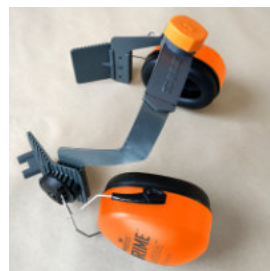
401011 Headband (PRIME)

Fits on helmets - Blastsafe ORIGIN - Silencer Blasthelmet (older versions)