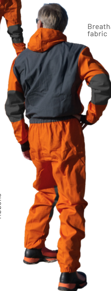
Ergonomic sports cuff ribbons