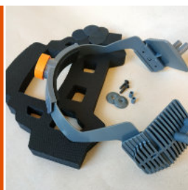
401004 Headband, brackets and detachable softpad - Complete Fits on helmets - Blastsafe ORIGIN