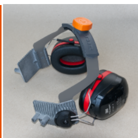
401003 Headband (OPTIME3) - Complete Fits on helmets - Blastsafe ORIGIN