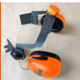
401011 Headband (PRIME) - Complete Fits on helmets - Blastsafe ORIGIN