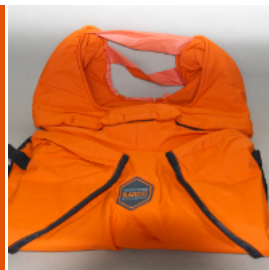
500000 Cape - top and bottom (premium) - Complete Fits on helmets - Blastsafe ORIGIN - Silencer Blasthelmet (older versions)