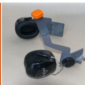
401008 Headband (VIPER2) - Complete Fits on helmets - Blastsafe ORIGIN