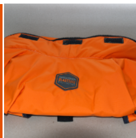
500020 Cape bottom (premium) - Complete Fits on helmets - Blastsafe ORIGIN - Silencer Blasthelmet (older versions)