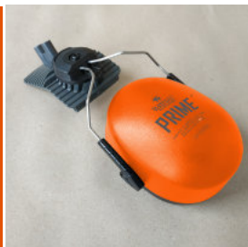
401012 Bracket and ear muff - single (PRIME) - Complete Fits both sides on helmet - Blastsafe ORIGIN