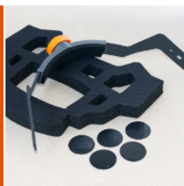
401005 Headband and detachable softpad - Complete Fits on helmets - Blastsafe ORIGIN - Silencer Blasthelmet (older versions)