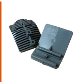
202012 Bracket - Ear muff - PAIR Fits on helmets - Blastsafe ORIGIN