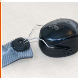
401009 Bracket and ear muff - single (VIPER2) - Complete Fits both sides on helmet - Blastsafe ORIGIN