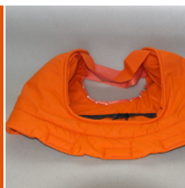
500010 Cape top (premium) Fits on helmets - Blastsafe ORIGIN - Silencer Blasthelmet (older versions)