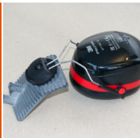
401001 Bracket and ear muff - single (OPTIME3) - Complete Fits both sides on helmet - Blastsafe ORIGIN